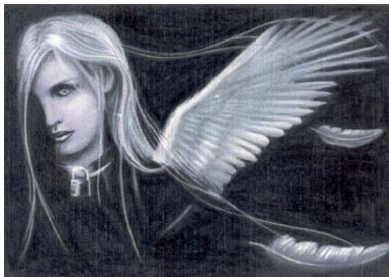
Brett Bogle - UCI, Raiford, FL